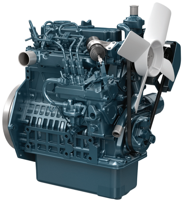
Photograph may show non-standard equipment.